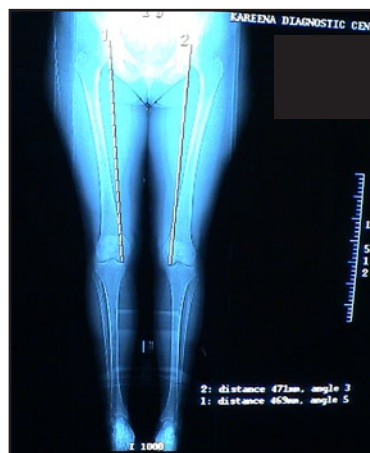
Figure 1: CT Scanogram

If you prescribe the patient orthotics and have NOT MEASURED leg length (when the patient does have a leg length discrepancy) the orthotic will invariably remove the normal body compensation of the 'long leg pronation'. This jamming action will create problems with the SI joint and the long leg may also contribute to the development of a scoliosis, as stated in Blake & Ferguson, 1992.